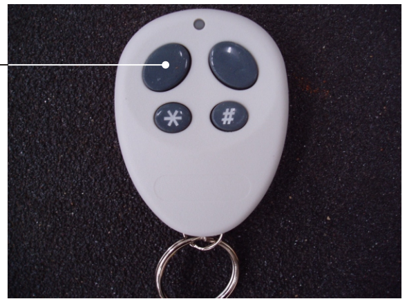
Program Switch (Learn)

Locate the program switch under the access panel on the front of the Aqua-matic as shown above.